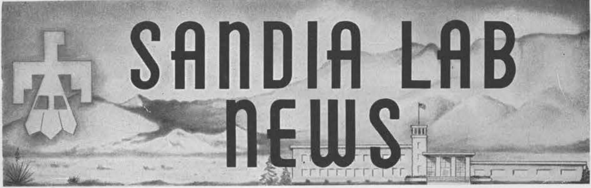
published every other friday for the employees of sandia corporation, contractor to the atomic energy commission